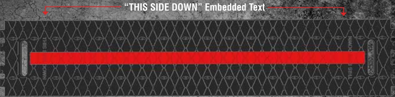
Embedded Text and Red Stripe on Bottom of RoadQuake 2F TPRS (1/2 Strip Shown)

Field tests in active work zones indicate that the warnings effectively direct workers to deploy strips correctly.